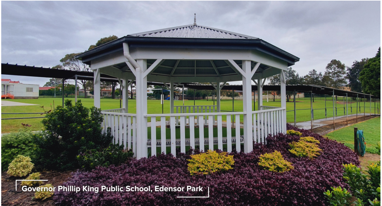
Governor Phillip King Public School, Edensor Park