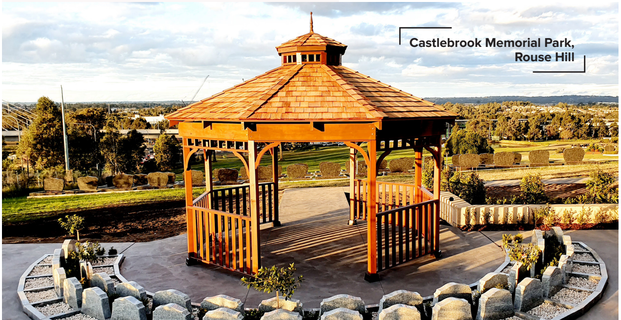
Castlebrook Memorial Park, Rouse Hill